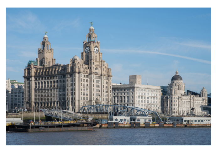
The Three Graces, Liverpool City Region

infrastructure, including 10GM and GMCVO, social enterprise, and VCSE providers, with links, through infrastructure organisations and equalities networks, to the 17,000 VCSE organisations in Greater Manchester. The Leadership Group's main bulletin has over 2,000 direct contacts. As a Leadership Group, as part of connecting to the wider sector, we use formal working groups (commissioning, inclusive economy, population health, workforce, GM VCSE mental health leaders and GM=EqAl), short term task and finish groups, focused networks (eg homelessness), assembly events, consultations, and roadshow events being held with leaders in the ten boroughs.