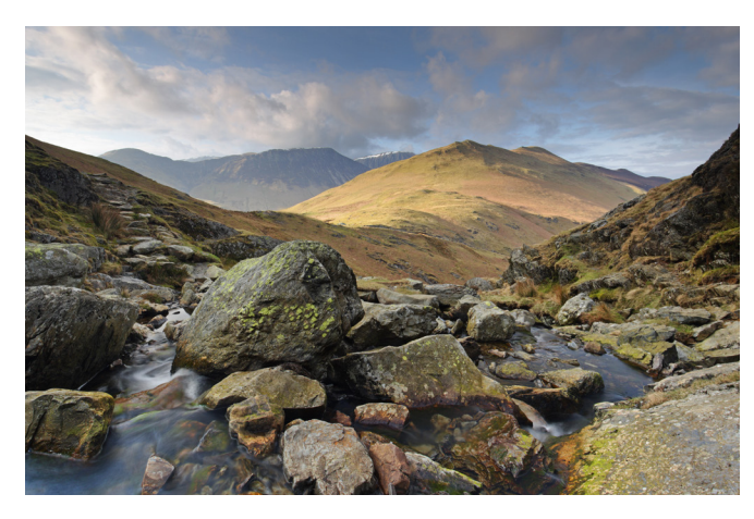
Mossforce, Lake District National Park, Cumbria

Nationally, we have maintained our links to NHS England's voluntary sector team. Over the past five years, we have successfully lobbied for a VCSE Partnership programme, linked to the NHS's 42 Integrated Care Systems (ICS), modelled on our work in Greater Manchester, to be rolled out. VCSE Partnerships or Alliances are now established right across England, generally with six-figure annual local investment and clear goals for improved NHS-VCSE working, this includes