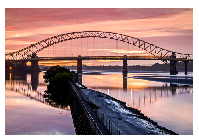
Runcorn Widnes Bridge, Cheshire

Across Cheshire and Merseyside, we are supporting and promoting the VCSE role in health neighbourhoods and primary care, Integrated Care Partnerships, and placebased working. An important aspect of this is developing relationships with acute and community health providers. We are a key partner in the C&M NHS strategy and implementation.