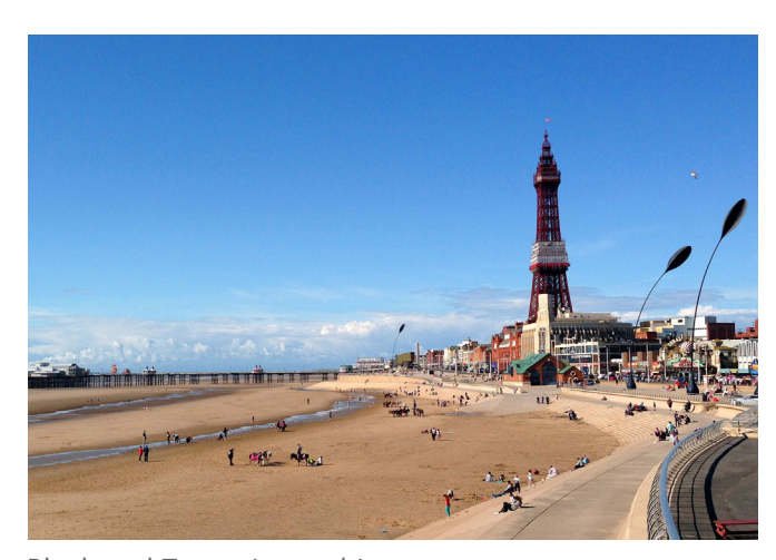
Blackpool Tower, Lancashire