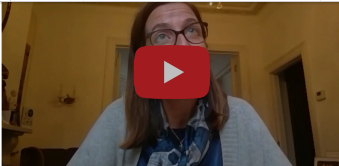
Part 1: The Funders Perspectives