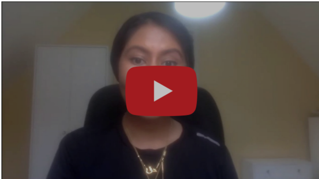
Guest Speaker Highlights