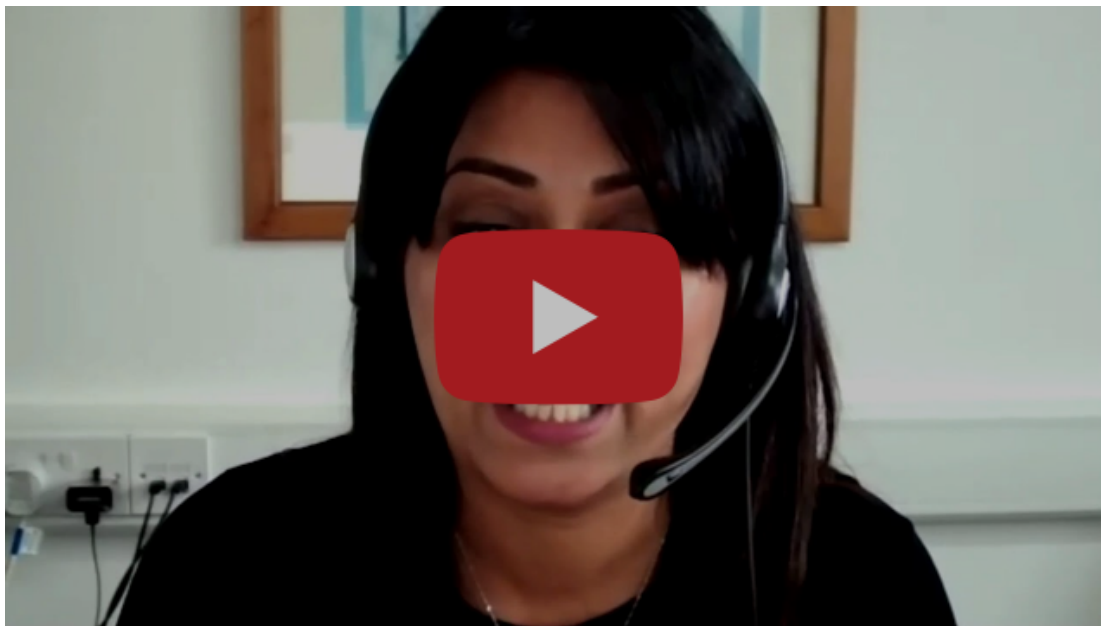
Part 1: The Sub-region Perspective