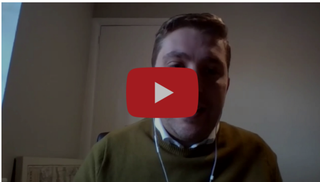
Part 2: The National Perspective