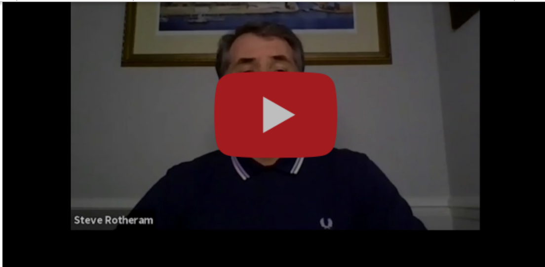
Opening Remark Highlights